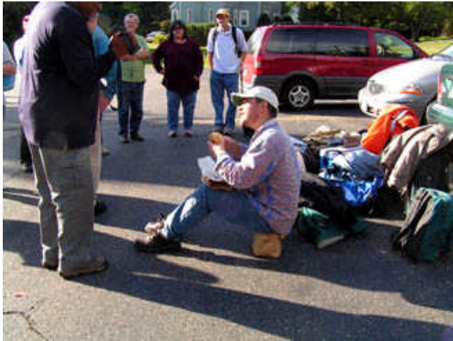
The group gathers and waits for the bus to arrive.