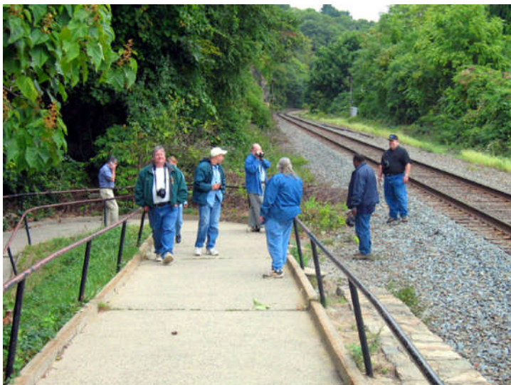
And of course, a little train watching was enjoyed by all.