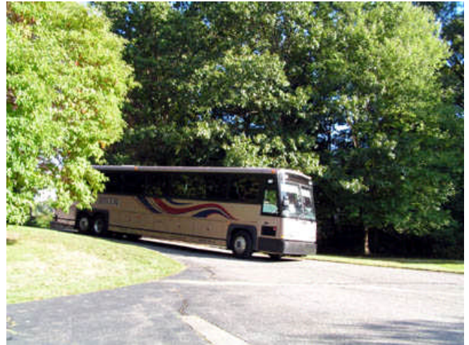
The bus arrives.